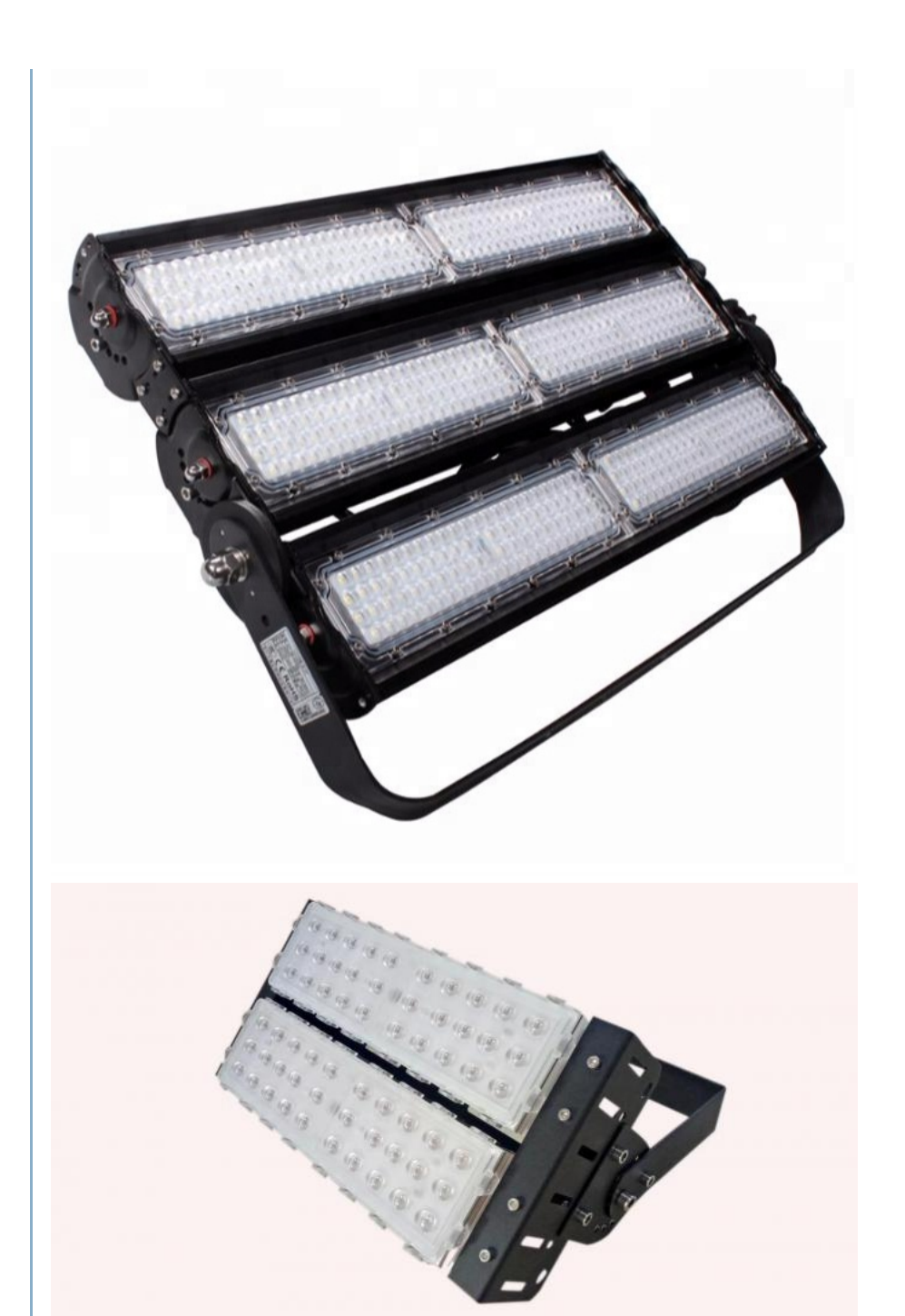
APPLICATIONS FOR PROJECT: