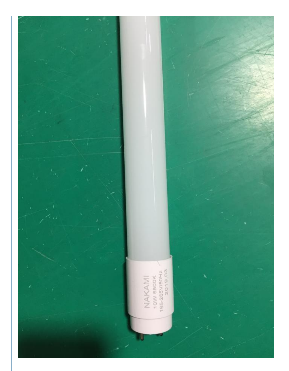
THE GLASS TUBE IN PRODUCTION TEST: