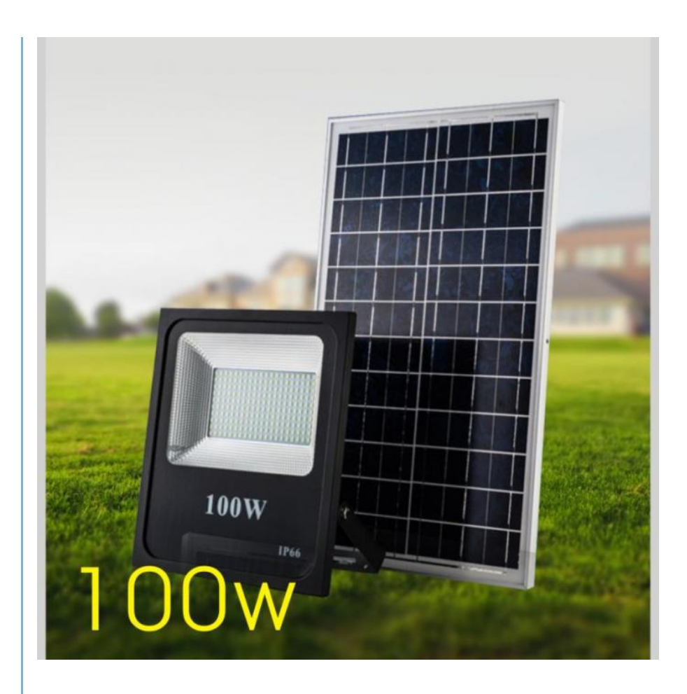
APPLICATIONS FOR THIS SOLAR FLOOD LIGHT IN GARDEN