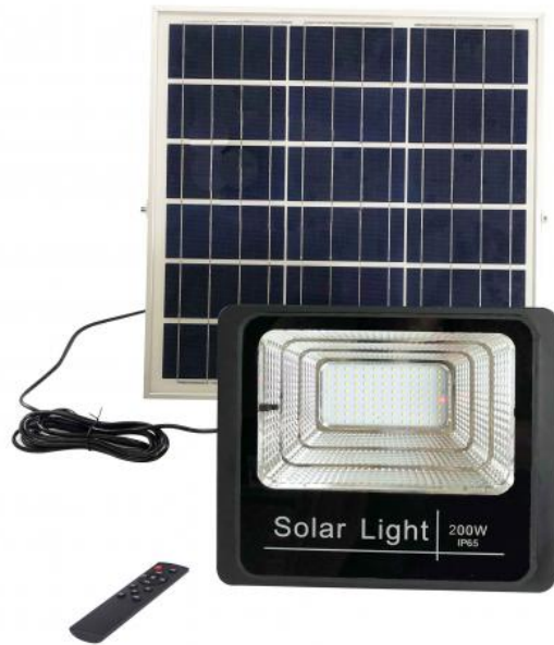
INSIDE MATERIAL FOR THIS SOLAR LED FLOODLIGHT: