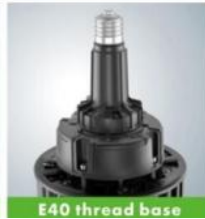
E40 thread base