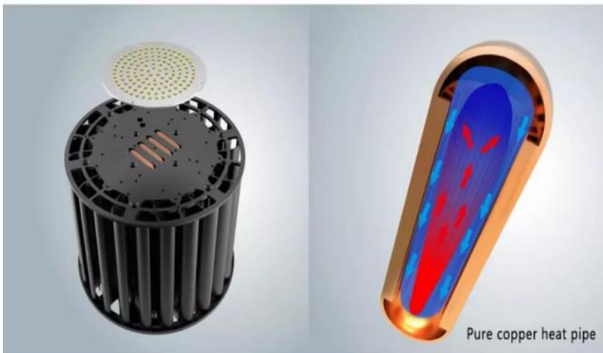
Pure copper heat pipe

Pure copper heat pipe and heat source distance fitting, rapid heat conduction to the main heat generated from the light source, the heat transfer rate is over 200 times the aluminum radiator.